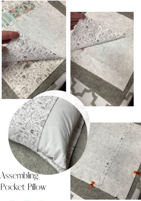
Assembling Pocket Pillow