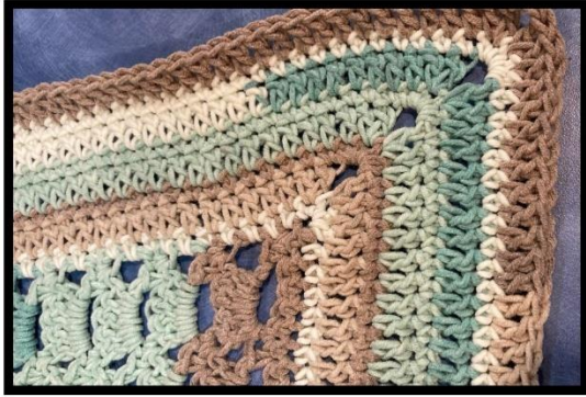
Easing Single Crochet Stitches on Side